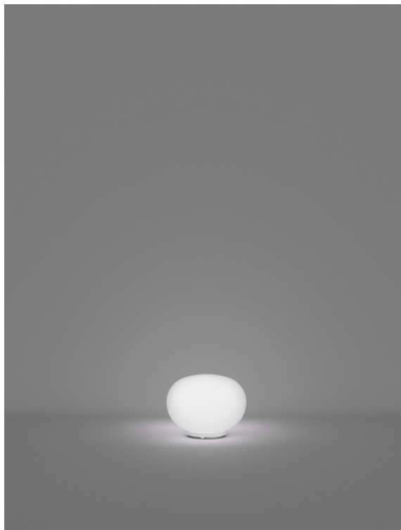
LUCCI LT 18 BCST BC 14E CE