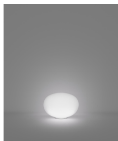
LUCCI LT 27